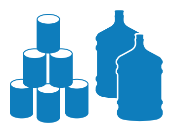
12% donated supplies like food and money

Survey respondents also provided assistance to others despite difficulties they were facing.